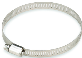
Round Member Adapter for 4–5 in round members