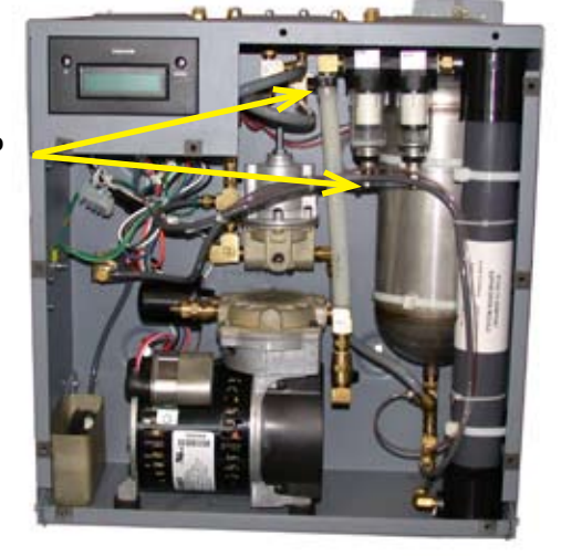
Remove clamp /detach hose

Step 2 Remove clamp from hose and detach hose from barb fitting on the filter assembly.